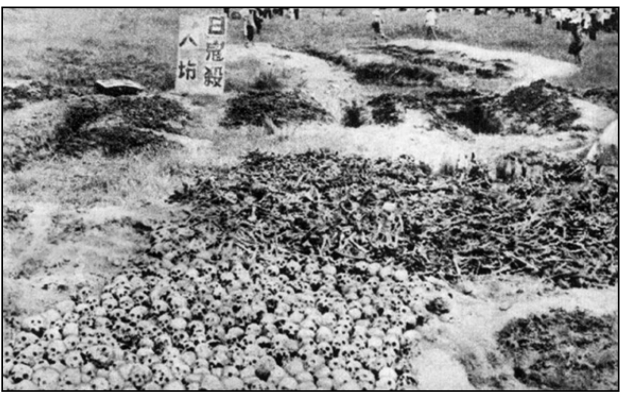
Source: China: Past & Present Web site (www.bergen.org/AAST/Projects/ChinaHistory)

In December of 1937, the Japanese Imperial Army marched into China's capital city of Nanking and proceeded to murder 300,000 out of the 600,000 civilians and soldiers in the city. After just four days of fighting, Japanese troops smashed into the city with orders issued to "kill all captives." The terrible violence - citywide burnings, stabbings, drownings, rapes, and thefts - did not cease for about six weeks. It is for the crimes against the women of Nanking that this tragedy is most notorious. The Japanese troops raped over 20,000 women, most of whom were murdered thereafter so they could never bear witness.