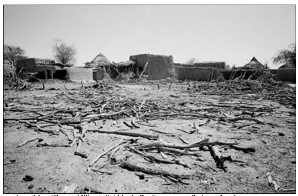
The remains of the village of Jijira Adi Abbe in Darfur, western Sudan, after the government attack.

Violence and destruction are raging in the Darfur region of western Sudan. Since February 2003, government-sponsored militias known as the Janjaweed have conducted a calculated campaign of slaughter, rape, starvation and displacement in Darfur.