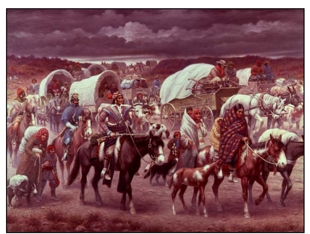
"The Trail of Tears" Painting by Robert Lindneux in the Woolaroc Museum, Bartlesville, Oklahoma

The genocide of peoples indigenous to the U.S. portion of North America proceeded along different tracks, each defined by the policies of the colonial power pursuing it. The colonization began in 1607 when England's Jamestown colonists arrived in presentday Virginia with instructions to "settle" the already heavily populated coastal area. Beginning in 1830, the U.S. undertook a policy of "removing" all native people from the area east of the Mississippi River. In the series of interments and thousand-mile forced marches which followed, entire peoples were decimated. The Cherokees, for instance, suffered 50 percent fatalities during the "Trail of Tears"; the Choctaws, Chickasaws, Seminoles and Creeks, 25 to 35 percent apiece.