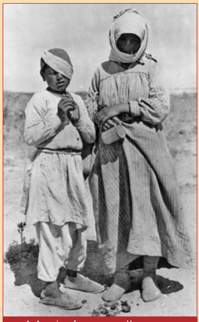
1919: An Armenian refugee woman and her son.

Although Armenia was at times a kingdom, in modern times, Armenia has been an independent country for only a few years. It first gained independence in 1918, after the defeat of the Ottoman Empire in World War I, but this ended when Armenia was invaded by the Red Army and became a Soviet state in 1920. With the dissolution of the Soviet Union in 1991, Armenia was the first state to declare its independence, and remains an independent republic today. Armenia is a democracy and its borders only include a very small portion of the land that was historic Armenia.